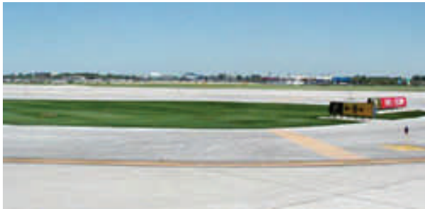
14L -32R Runway Resurfacing Project at O'Hare

AvTurf® begins Capital Improvement Projects at O'Hare and Midway Airports in Chicago.